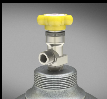
Use with Hand wheel style Chlorine and SO2 Valves

Halogen Valve Systems, Inc. 1342 Bell Avenue, Suite 3C Tustin, CA 92780 USA Tel: +1 949-261-5030 Fax: +1 949-261-5033 Toll Free (877) 476-4222