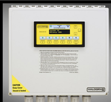
Use with Hexacon III 6 station Controller