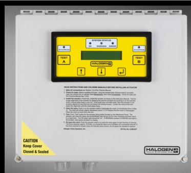
Use with Duplex II 2 station Controller

valve closures. Because the system can detect a spike in electrical current to the motor, the actuator is able to detect the torque that is generated as the valve begins to engage the valve seat. This unique and patented feature allows the operators to know that not only did they activate their system, but that the valve is actually closed. No other actuator on the market is able to make this claim.